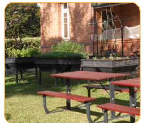
New seating for the Kitchen Garden outdoor classroom.