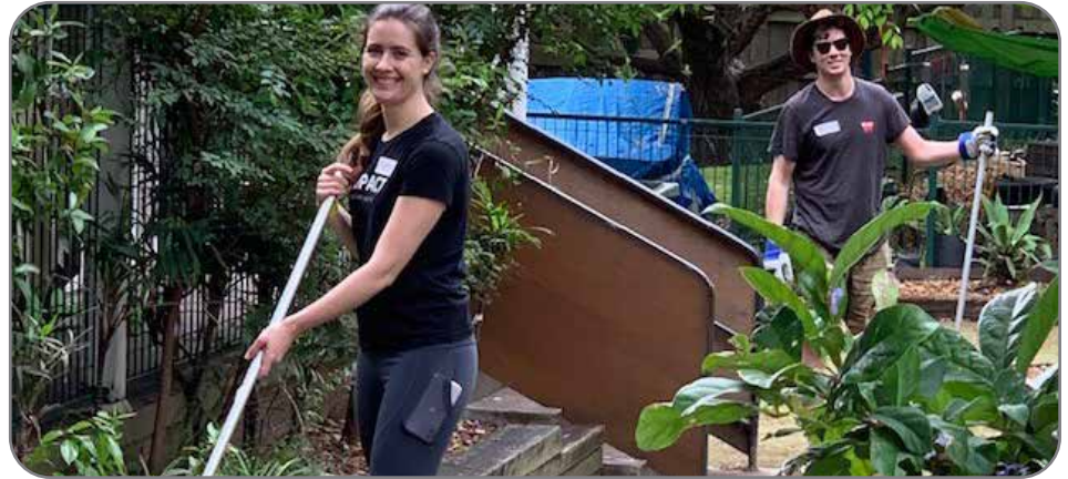
November 2020: We welcomed a keen volunteer team from Deloitte, our first Corporate Volunteers following the suspension of the program in early March.

One of the most challenging aspects of the COVID-19 pandemic has been the way in which it has limited our capacity to welcome our friends, donors and supporters onsite. However, as restrictions eased during late 2020 and early 2021, we began welcoming back visitors with COVID-safe measures in place.