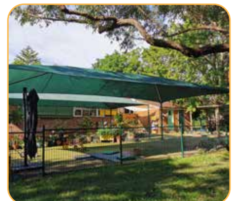
Robinson House's new shade sail.