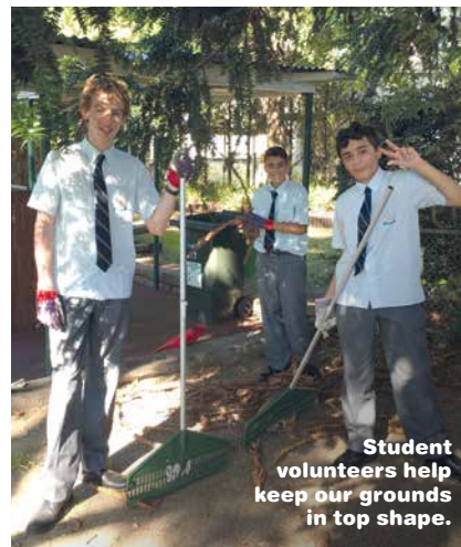
Student volunteers help keep our grounds in top shape.

This year The Infants' Home have been lucky to have students from De La Salle College Ashfield volunteer with us after school for an hour each Wednesday as part of their Duke of Edinburgh Award Community Service Program. We are grateful for their enthusiastic and ongoing help to keep our playgrounds, gardens and centres looking good.