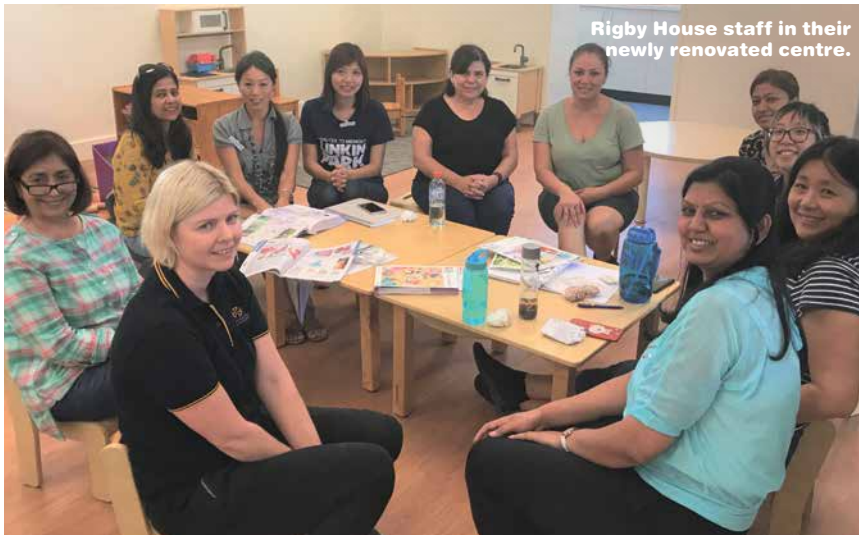
Rigby House staff in their newly renovated centre.