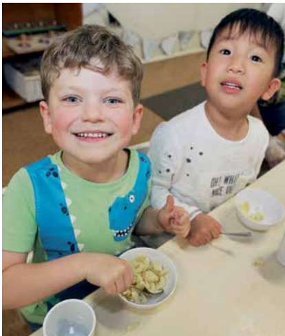
Children have been enjoying freshly-prepared meals from the new kitchen.

the infants' home CHILD & FAMILY SERVICES