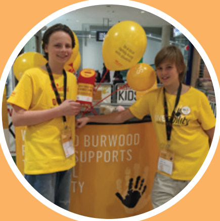
TIH Staff and their families helped collect donations

August 6<sup>th</sup> – a great effort. This will be matched by Westfield Head Office, resulting in a total contribution of $14,000 towards the Sydney Child Development Clinic, to provide early intervention health and support services for the community. GiveAbility Day is held nationally by Westfield centres to raise money and awareness for disability support services and we thank them for their generosity and partnership.